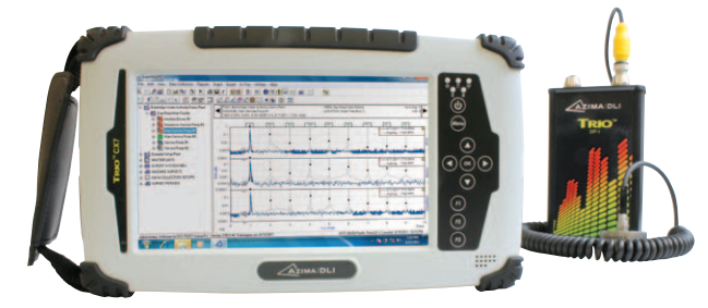
TRIO CX7 tablet, data processor and triaxial vibration sensor

TRIO <sup>™</sup> has arrived and is demonstrating that there is a better way to implement machine condition monitoring. TRIO is more than a vibration data collector; it is a powerful computerized system in a mobile industrial package that sets aside the traditional data collection model and brings forth a new focus on ergonomics, efficiency and safety. TRIO will improve the effectiveness of your condition monitoring program and will allow you to get more done in less time with a high degree of success while lowering the overall cost of your program.